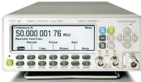
Figure 2: Measure function selection menu, shown with measured results.